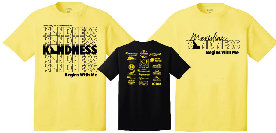
2019 School Shirts