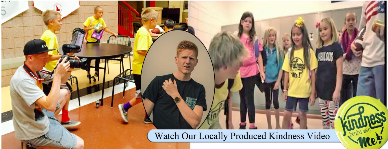
Watch Our Locally Produced Kindness Video